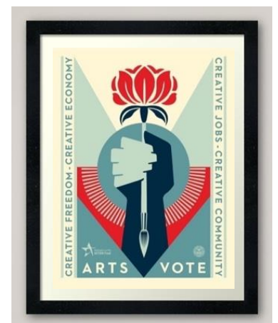
Image is for display purposes. The actual poster will also feature Shepard Fairey's signature on the bottom right corner and the official limited-edition number.