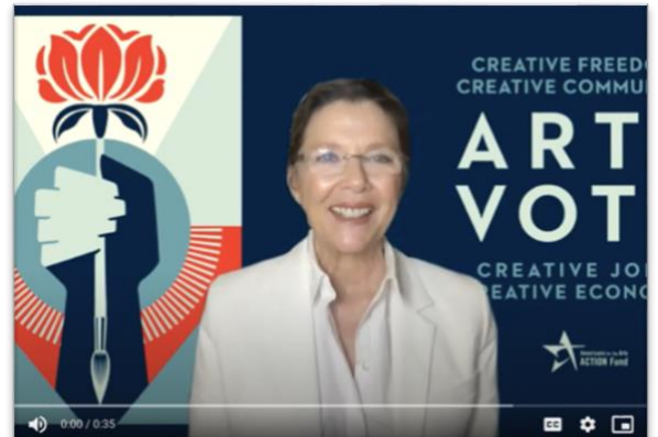
Artists such as Annette Bening volunteered their time and passion to this year's ArtsVote campaign by producing customized video messages and participating in virtual events across the country. www.ArtsActionFund.org/ArtistArtsVoteVideos