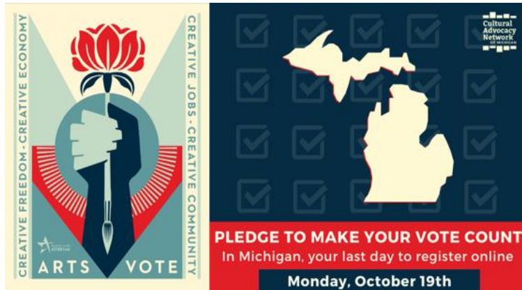
This is an example of one of our Facebook and Instagram paid ads targeting arts enthusiasts in Michigan about their state's voter registration deadlines. We targeted 19 battleground states with these kinds of ads to get the ArtsVote out! www.ArtsActionFund.org/StateAds

In such an unprecedented time, your support helped us go the extra mile in ensuring that the arts community had the most up-to-date voter information, especially in 19 battleground states.