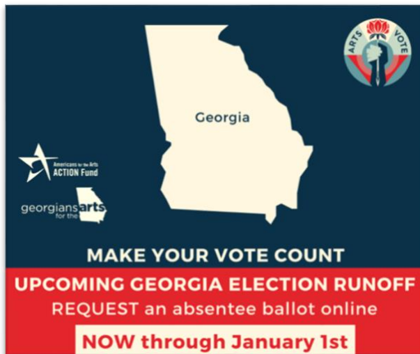
Georgia Senate Election Runoffs will take place on January 5, 2021. Our ArtsVote ads are already running. www.ArtsActionFund.org/GeorgiaAds

And now it is time to focus on ArtsVote in the Georgia Senate Election Runoffs . These runoffs are vital in securing a pro-arts Senate in this election cycle. Imagine the incredible arts policies we could pass with a pro-arts House, Senate, and White House! We're already running new Google, Facebook, and Instagram ads with our state partner Georgians for the Arts .