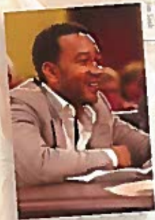
Grammy Award-winning musician John Legend testifies during Arts Advocacy Day on the theme of how the arts fuel creativity and power innovation.