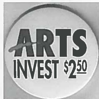
New York arts advocates wore their successful message on buttons at the state Capitol.

Arts organizations in New York are eagerly anticipating the first budget increase for the New York State Council on the Arts (NYSCA) in six years. The state