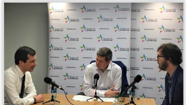
Presidential candidate Mayor Pete Buttigieg sits down with ArtsVote 2020 Chair Ben Folds and Senator Mark Begich in our podcast interview to discuss his background and vision for the arts, if elected President of the United States.

We're also talking to presidential candidates directly . In addition to the advocacy work of grassroots members like you, we've enlisted acclaimed musician Ben Folds to serve as Chairman of ArtsVote 2020. Ben, with the help of former U.S. Senator Mark Begich, has taken the lead in our new podcast series " ArtsVote 2020 with BenFolds " in order to get presidential candidates on the record about arts policy issues. You can listen to the podcast interviews at www.ArtsActionFund.org/podcast .