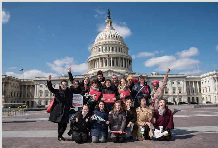
Arts Action Fund members from across the country stand up for the arts at the U.S. Capitol. These grassroots art advocates also convinced Congress to stand up to President Trump's budget proposal to terminate the National Endowment for the Arts and to successfully push forward to increase funding for the arts and humanities.

Will you stand up for the arts and ask questions to candidates?